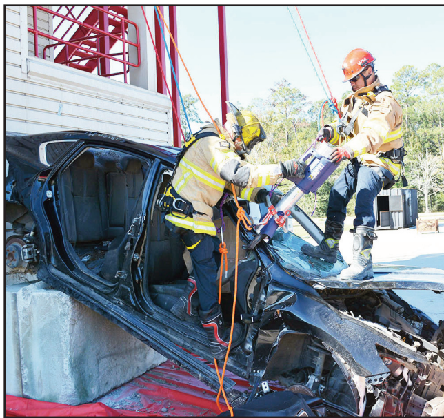
Firemen decide how to best use the Jaws of Life for this car dangling off the side of a bridge.